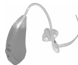
118/45 Next Essential Moda II

Next Essential Moda II is suitable for fitting mild to moderately severe hearing losses and can fit audiogram configurations ranging from reverse to precipitously sloping.